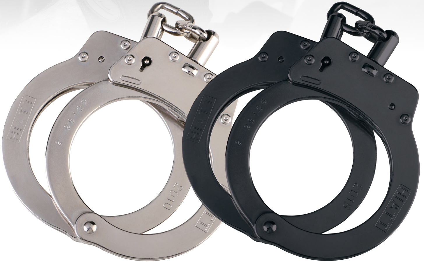
Model 2010-H: Nickel Plate finish