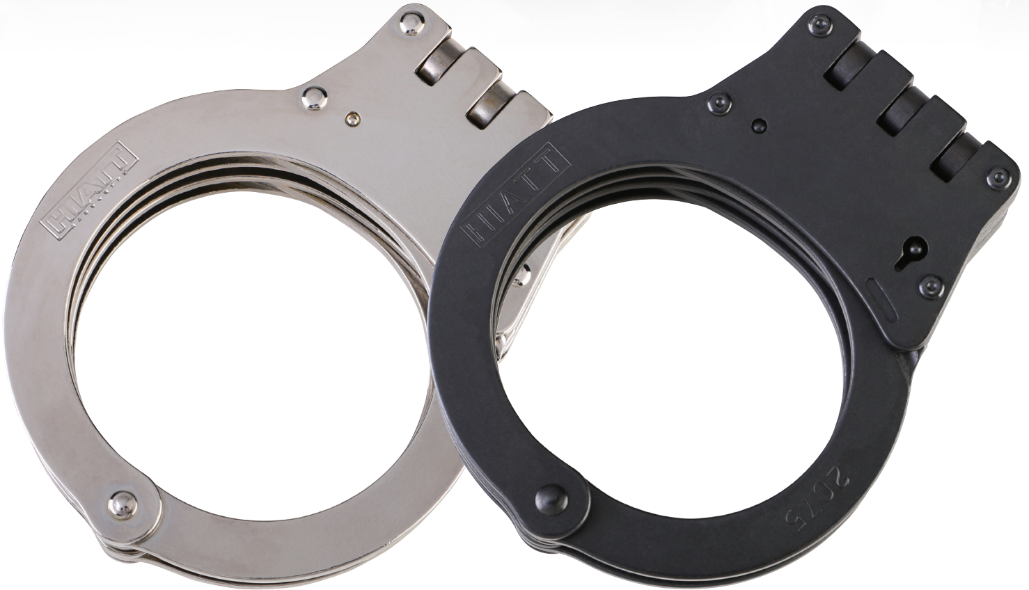
Model 2054-H: Nickel Plate finish