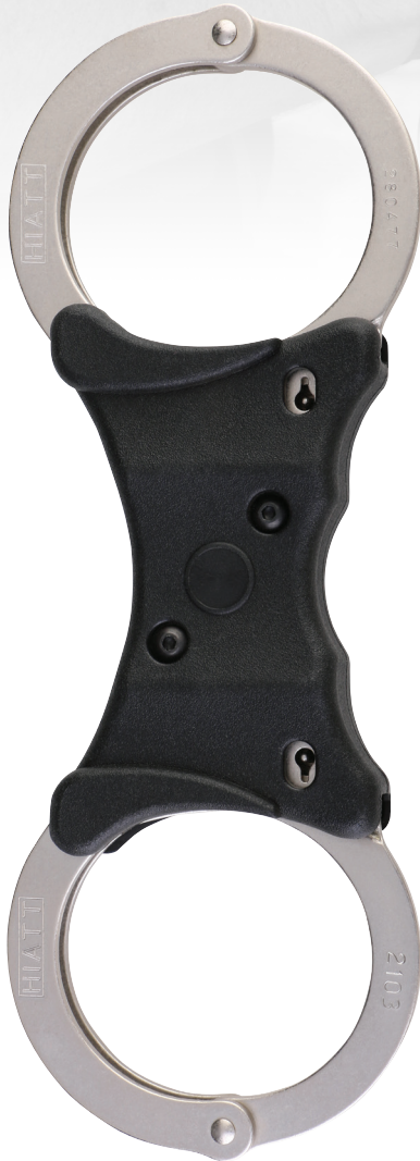
Model 2103-H: Nickel Plate finish