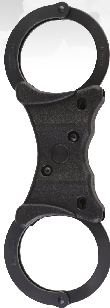
Model 2105-H: Black finish